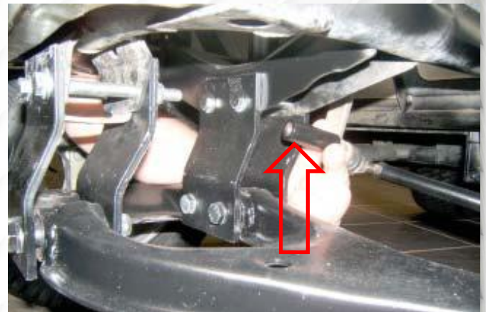
SPACER PLACEMENT IN RISER