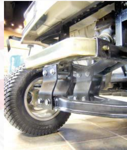
FRONT A-ARM RISERS notched on the rear

Place the FRONT SHOCK EXTENSIONS into the upper shock mount (flat end is up). Measure 3-1/4" down from the top of the shock mounting area and or 5-1/2" up from the bottom of the vertical flat frame. Drill a 13/32" hole in the center of the flat frame. DO NOT DRILL THE SECOND HOLE AT THIS TIME. After you drive the car and set the camber where you want it, then drill the second hole. Install the tires and test drive the car. Check the toe in and camber once again and adjust as necessary.